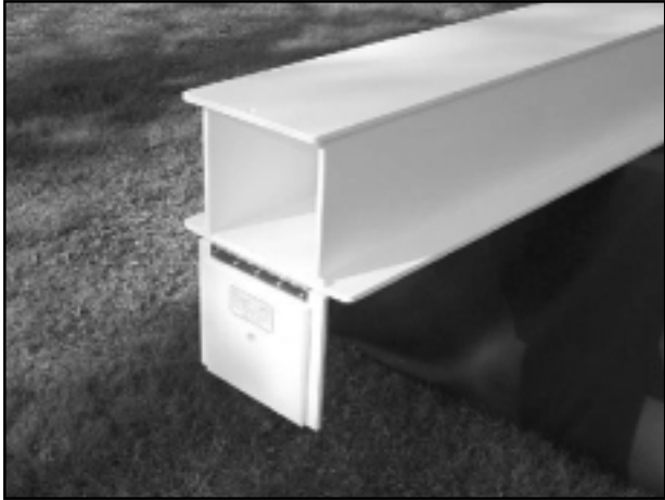
End Opening Storage Box